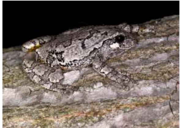
Green and gray phases of Gray Treefrogs

Halton/North Peel Naturalist Club, Box 115, Georgetown, Ontario L7G 4T1 Charity Registration number 869778761RR0001