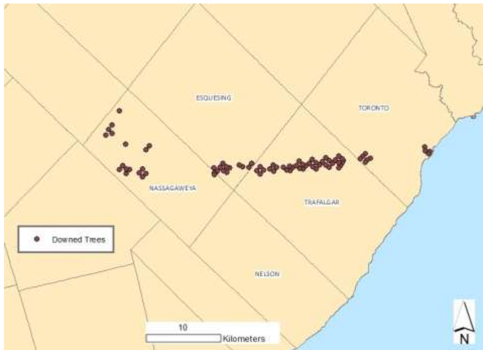
Fig. 1. Map of Halton showing location of windfall trees reported during original land surveys in 1819.

The new information is actually quite old. It is supplied within the records of forest cover recorded by the early land surveyors who laid out the lots and concessions in the then new townships within Halton [McLean et al. ]. The surveyors were required to record the dominant tree species in the area along with characteristics of the land that they travelled through. Fortunately, they made note of a number of sites where the trees had been knocked over. These sites were listed as ‘windfall’. Only a tiny area affected by the wind was recorded in the earliest survey (1806) of Trafalgar Township. The vast majority of the affected area was noted in the northern surveys completed in 1819. Even if the tornado had caused the damage at the latest estimated date, nearly thirty years had elapsed before the surveys were carried out and the windfall was still quite evident. It seems less likely that damage would be so noticeable if the tornado had passed during the early part of the suggested time frame for up to 80 years would have passed and much of the fallen wood would have decayed by the time the surveyors visited the area.