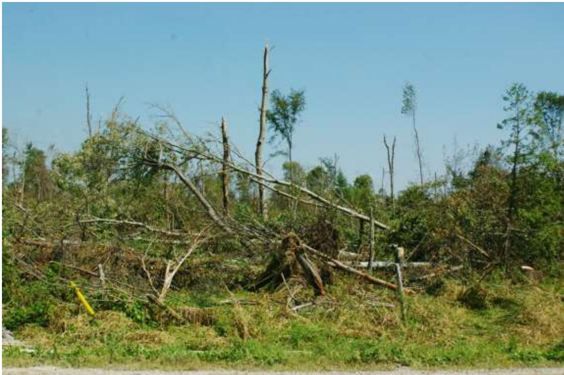
Fig 2. Appearance of tornado damage to young forest near Fergus following a tornado in August 2005.

The path of destruction across Nassagaweya was about a mile wide and started from about Lot 23 in Concession 1 (Fig. 1). It reportedly travelled eastward and passed completely across Nassagaweya and exited into Esquesing Township at Lot 8 [Nassagaweya Historical Society]. This would leave the Esquesing Conservation Area right in line with the cyclone course, only about a half kilometer from the border with Nassagaweya. The path crossed the present site of the interchange between Highway 401 and Highway 25. It then continued on past Drumquin to the area of the 9 th Line and Lower Base Line. The tornado damage was more extensive than the survey records for Halton show. After touching down near the Wellington County border, it travelled completely across Halton then continued into Peel County reaching almost to Port Credit (Paul O'Hara, pers. comm.). Overall, the damage extended in a straight line not less than 40 km in length with the main portion of the route occurring within Halton.